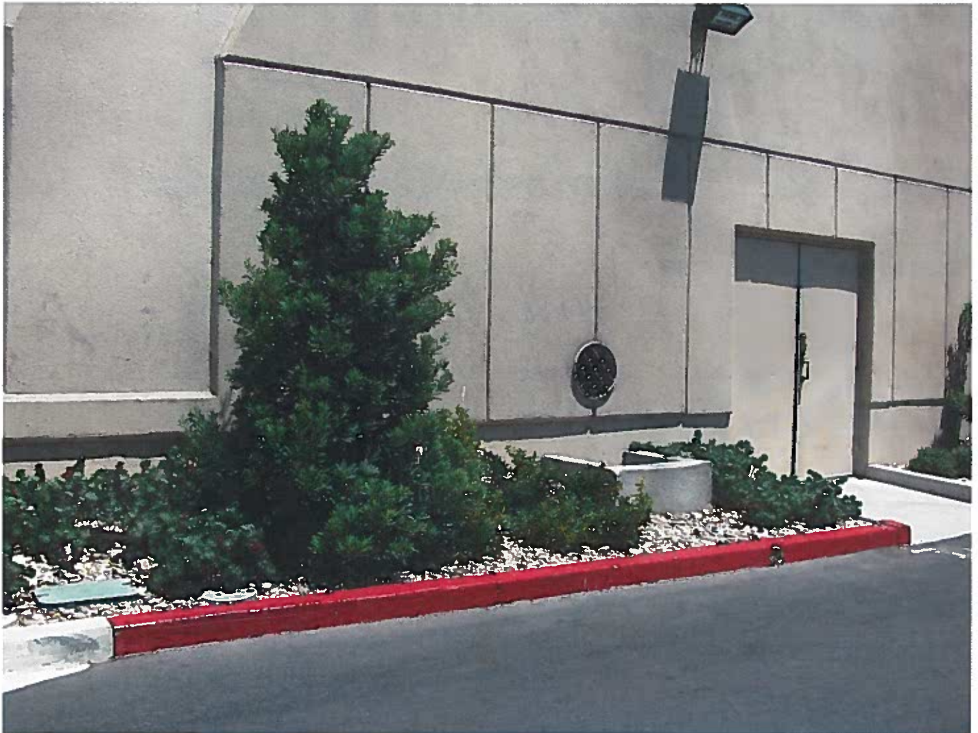
PLTFS' PROPOSED EXHIBIT NO. 93 000033