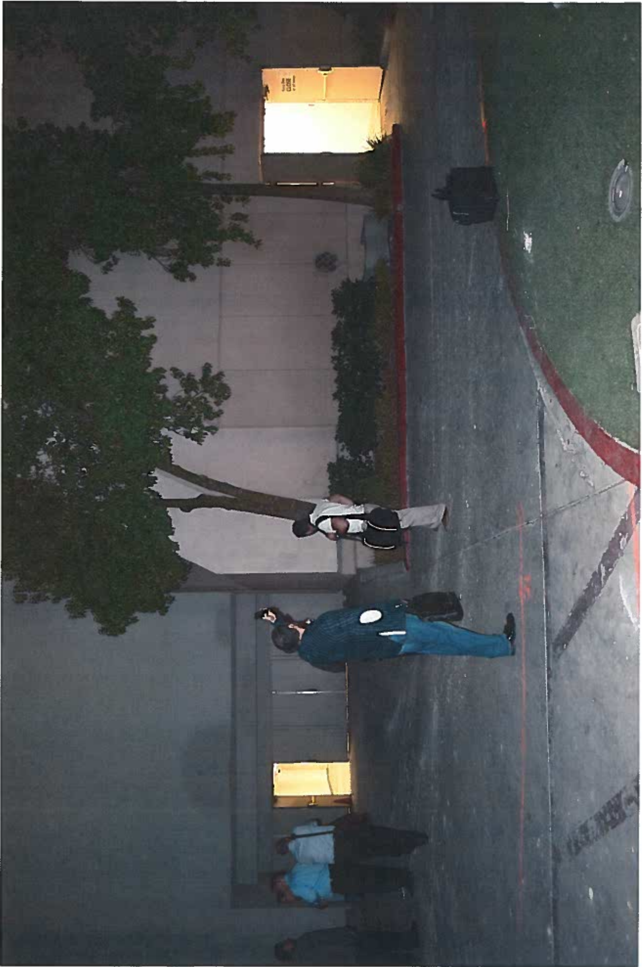
PLTFS' PROPOSED EXHIBIT NO 84 000020